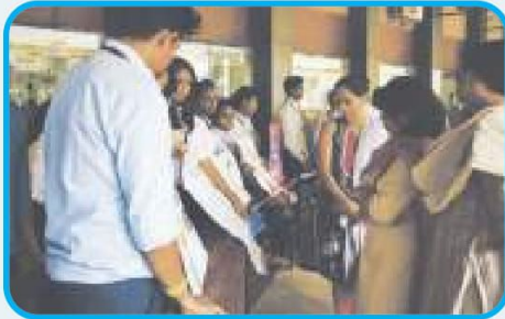
Poster Exhibition: Budget 2018