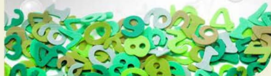
CERTIFICATE COURSE IN VEDIC MATHS

“NOW NO MORE USAGE OF CALCULATORS TO DO TOUGH CALCULATION, THIS COURSE MAKES MATHEMATICS FUN TO LEARN.”