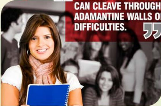
CERTIFICATE COURSE IN PERSONALITY DEVELOPMENT

“IT IS CHARACTER THAT CAN CLEAVE THROUGH ADAMANTINE WALLS OF DIFFICULTIES.”