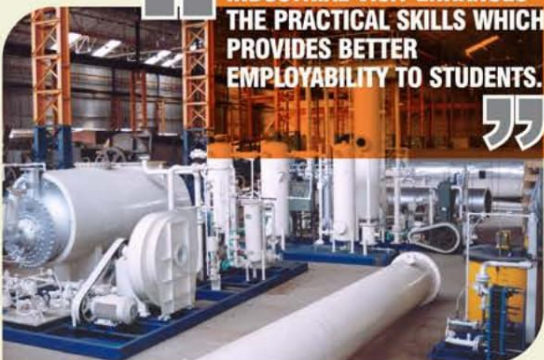
CERTIFICATE COURSE IN INDUSTRIAL VISIT

“INDUSTRIAL VISIT ENHANCES THE PRACTICAL SKILLS WHICH PROVIDES BETTER EMPLOYABILITY TO STUDENTS.”