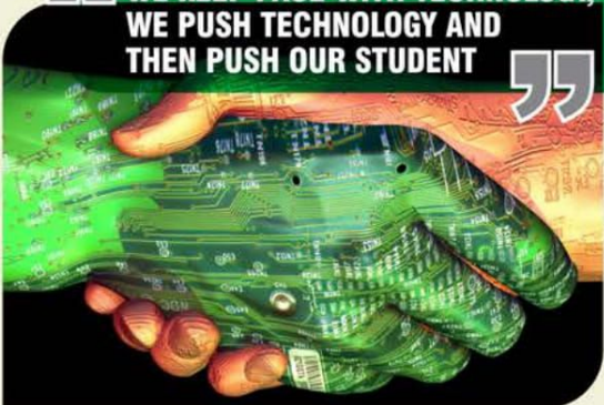
CERTIFICATE COURSE IN INFORMATION TECHNOLOGY

“WE KEEP PACE WITH TECHNOLOGY, WE PUSH TECHNOLOGY AND THEN PUSH OUR STUDENT”