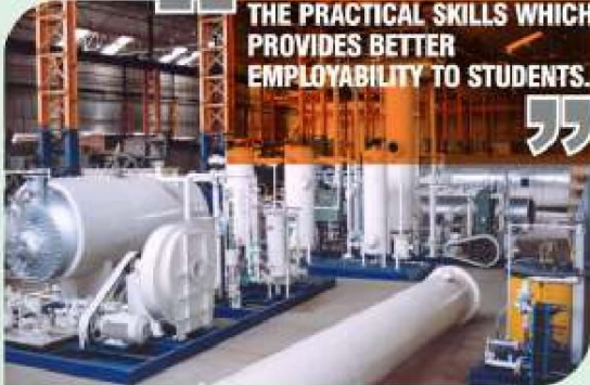
CERTIFICATE COURSE IN INDUSTRIAL VISIT

“INDUSTRIAL VISIT ENHANCES THE PRACTICAL SKILLS WHICH PROVIDES BETTER EMPLOYABILITY TO STUDENTS.”