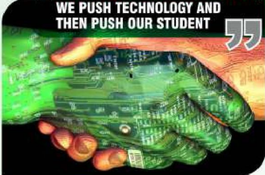
CERTIFICATE COURSE IN INFORMATION TECHNOLOGY

“WE KEEP PACE WITH TECHNOLOGY, WE PUSH TECHNOLOGY AND THEN PUSH OUR STUDENT”