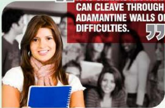
CERTIFICATE COURSE IN PERSONALITY DEVELOPMENT

“IT IS CHARACTER THAT CAN CLEAVE THROUGH ADAMANTINE WALLS OF DIFFICULTIES.”