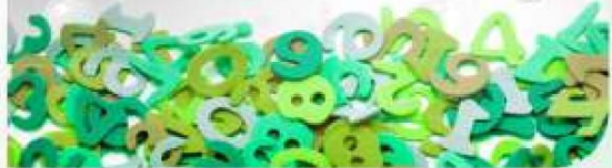
CERTIFICATE COURSE IN VEDIC MATHS

“NOW NO MORE USAGE OF CALCULATORS TO DO TOUGH CALCULATION, THIS COURSE MAKES MATHEMATICS FUN TO LEARN.”