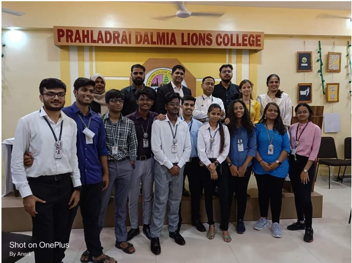
Shot on OnePlus By Anadi