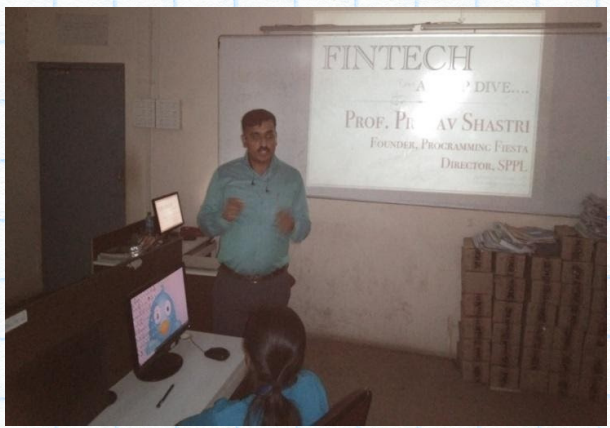
Presentation by the Guest