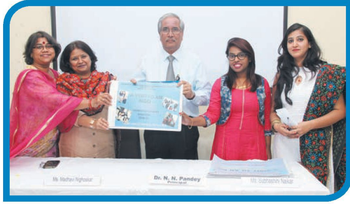
Showing Best Practice in the subject of F. C: Visit to NGOs