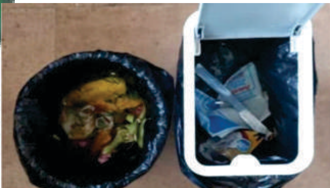
Separation of Dry and Wet Waste

Students were given 10 different activities to perform for 10 different days. The aim behind organizing this activity was to foster habits to ensure long term sustainability of our planet. Students were required to click 2 photographs for each day.