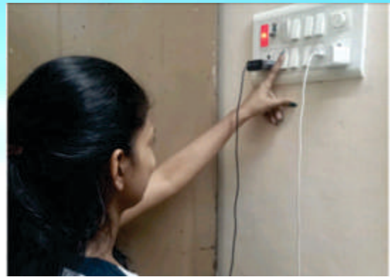
Switching off the charger when not in use