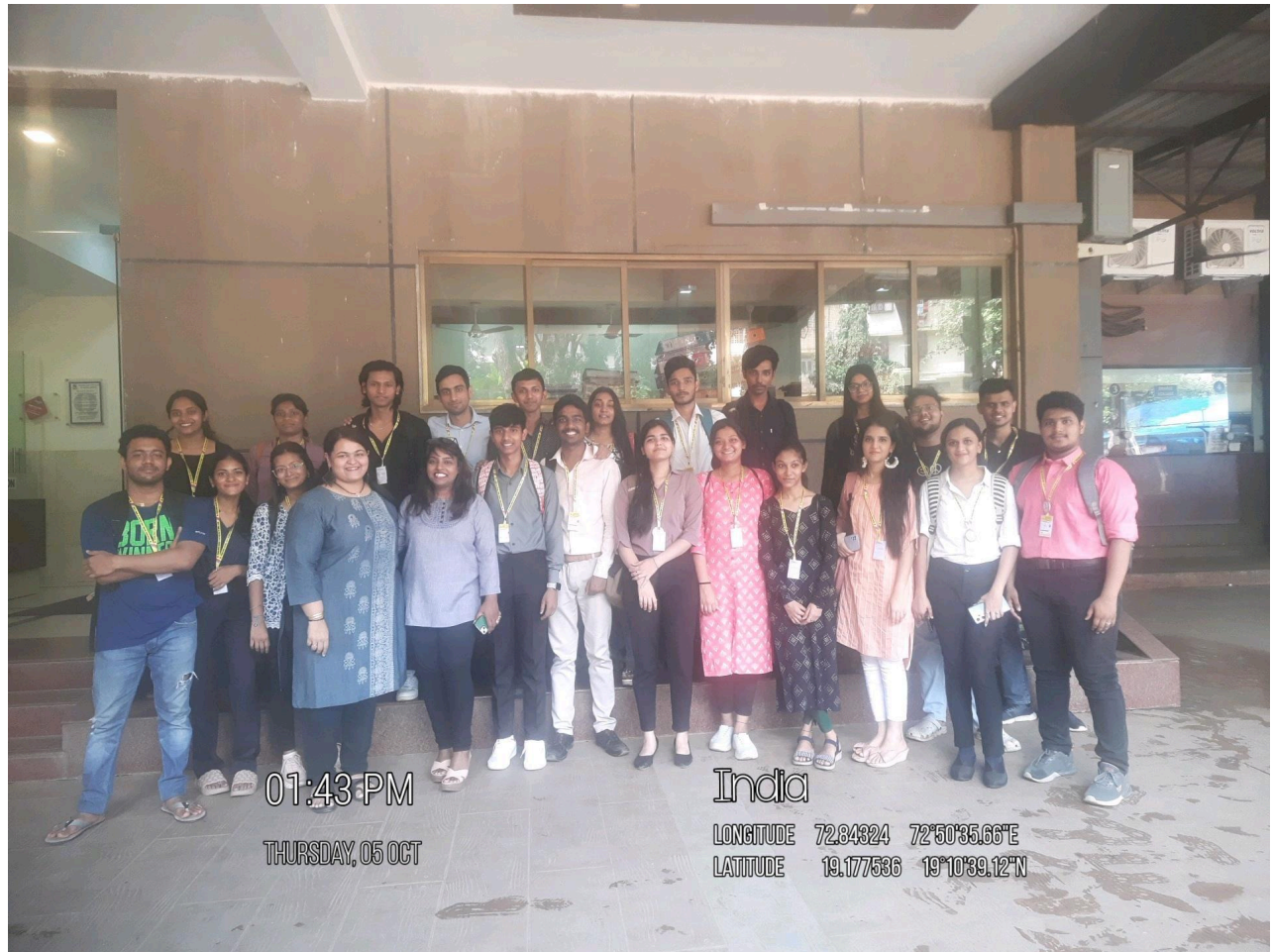
SEMINAR WITH WELINGKAR'S INSTITUTE ON "WHAT'S NEXT AFTER GRADUATION?"