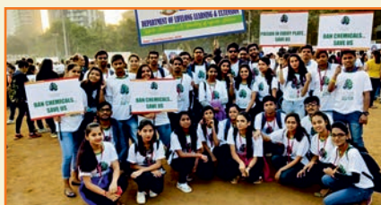
Glimpse of Walkathon