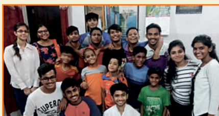
Glimpse of D - fest