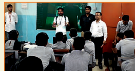
Glimpse of School Visit