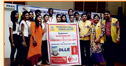
Glimpse of blood Donation Comp

To bring out the hidden artists in our students and to gauge their awareness quotient, Department of Lifelong Learning organized a Poster Making competition for DLLE Students who have opted for PEC on 27th September, 2018. 74 DLLE students in 13 groups beautifully created posters on the social issues of today's world like 'Save Ozone layer Save Environment', 'Swachh Bharat' and 'Women Safety'. The aim of the competition was to trigger the thought process of the students and to sensitize them towards the issues concerning our society and environment. Such activities and competitions create awareness about global issues among the students which helps in personality development.