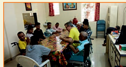
Glimpse of orphanage and old aged home visit

and Andheri. The students interacted with children and organized several competition for them. The extension students served them home-made food. Students donated stationery for their school use. The extension students discussed with them various issues relating to Hygiene & Safety and Awareness in Community Work and made them understand how they can be contributory factors towards positive changes in the society. Some students also visited to the old age home and also spent an hour with the aged in old age home, the extension students spent quality time with abandoned elders, providing them with the much-needed feeling of togetherness and bonding of a family, which makes their Diwali special. Students distributed fruits and sweets among the inmates and spent quality time with them. The visit gave a deep insight to the students into some of the bitter and disillusioned realities of life, which turned out to be an eye-opener for all.