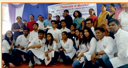
Glimpse of Udaan Festival