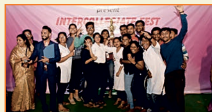
Glimpse of Karmah Festival