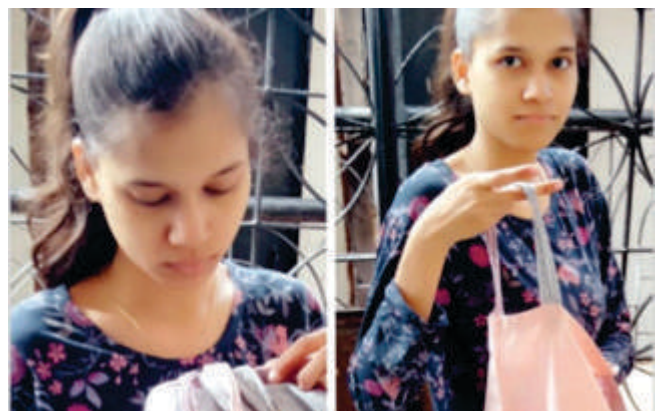
Carrying Cloth bag