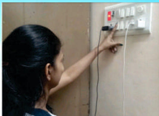
Switching off the charger when not in use