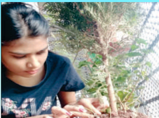
Planting a sapling